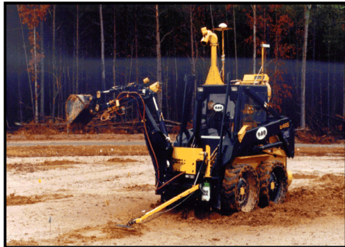
Detection & Excavation